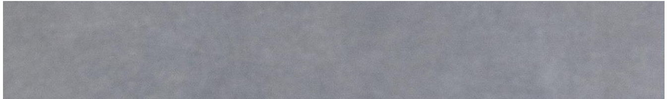
UHPC DARK GREY