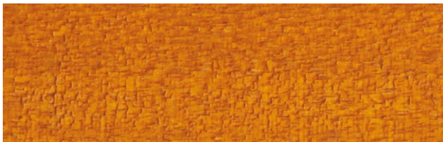
VARNISHED OKUMÉ PLYWOOD