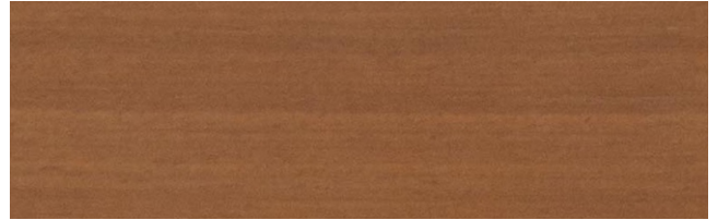
HARDWOOD WITH PIGMENTED IMPREGNATION