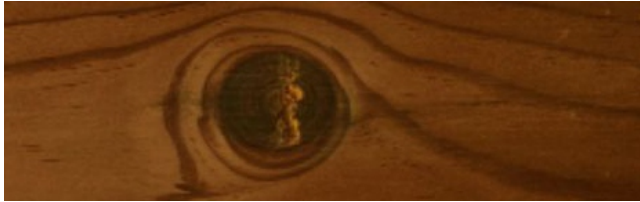
THERMO-TREATED PINE WITH PIGMENTED IMPREGNATION